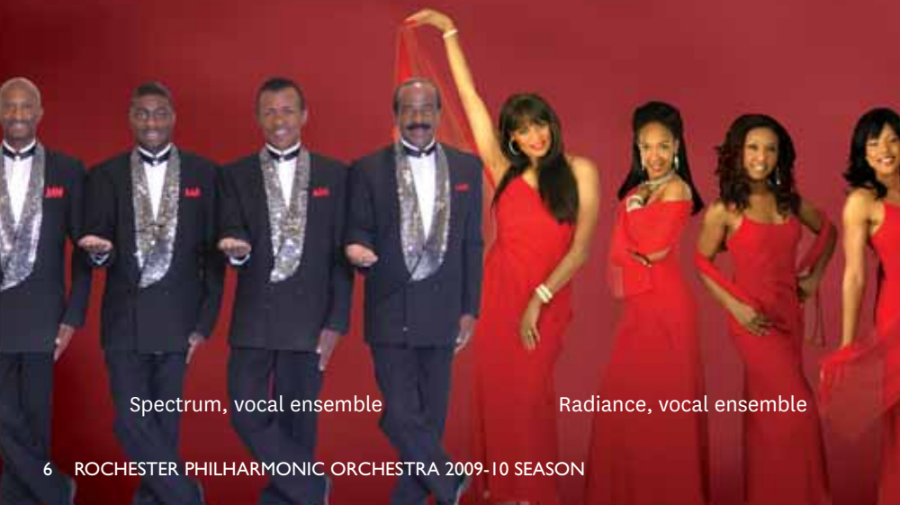
Spectrum, vocal ensemble