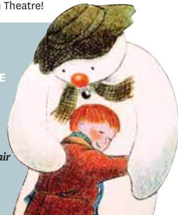
© Snowman Enterprises Ltd. 1982, 2009

Non-orKIDStra subscribers may add on this show for $15 Adults, $10 Children