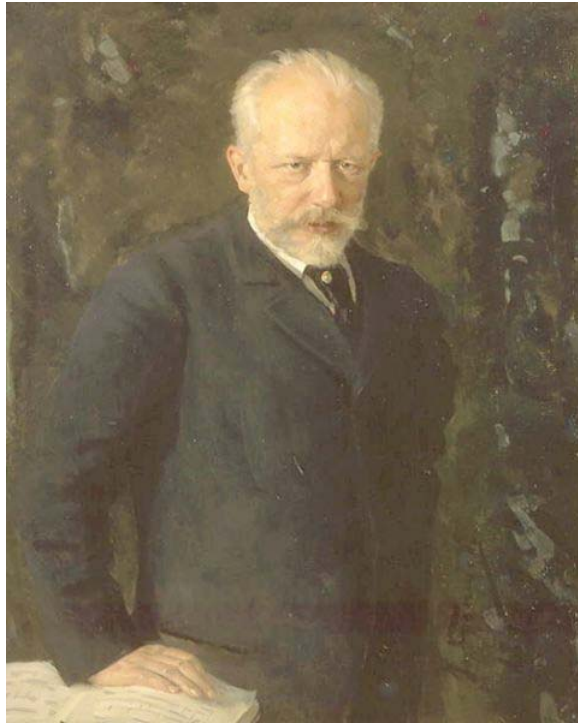
Portrait by Kuznetsov