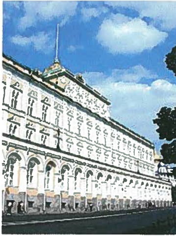
The Grand Kremlin Palace is part of the Moscow Kremlin and was completed in 1851.